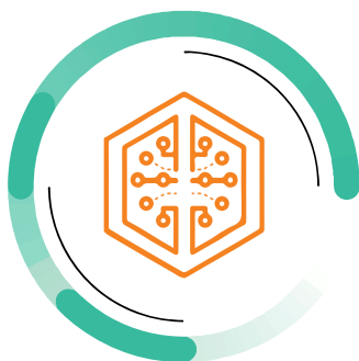
Detect and investigate