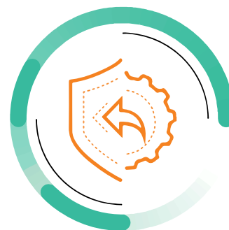
Respond and continually enhance