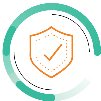
Prevent cyber threats

By deploying low-impact sensors on the endpoints reusing existing firewall and user-identity investments; behavior data is collected, enriched, and correlated with the help of an AI hunting engine. By doing up a large number of correlations per second, the performance against other detection toolsets is unparalleled.